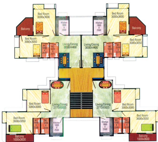
Floor Plan 1st, 2nd and 3rd Floor