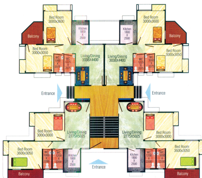
Floor Plan Ground Floor